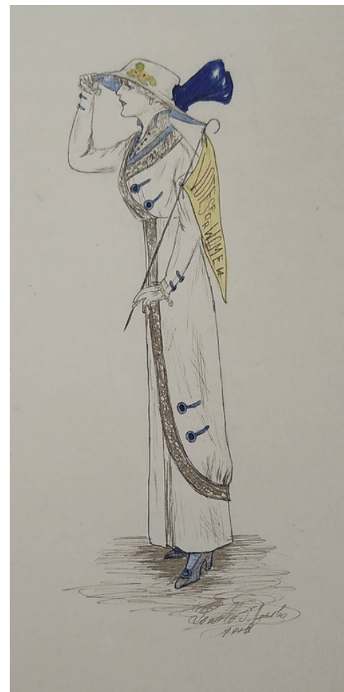
The Suffragette 1910s

"...the girls of Temple listened to an anti-suffrage speaker. Not very good but still got out of English..."