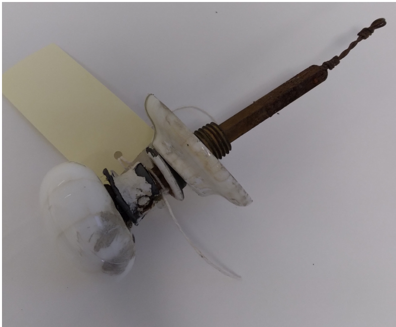
Door Bell Pull, 19th Century, MHS Collection

If you guessed that it is a bell pull, you're right! This is from the L. Naudain house just south of Middletown, which was torn down in the spring of 2019. Before the invention of electric door bells, people used mechanical ones. The white enamel handle was secured on the wall beside the front door, and the rest of it was hidden inside the wall, with the wire hook attached to another wire inside the house, attached to a small metal bell with a clapper. A visitor would pull the enamel handle toward himself to activate the mechanism. The Middletown Historical Society has many items in their architectural elements collection, to help document buildings now gone.