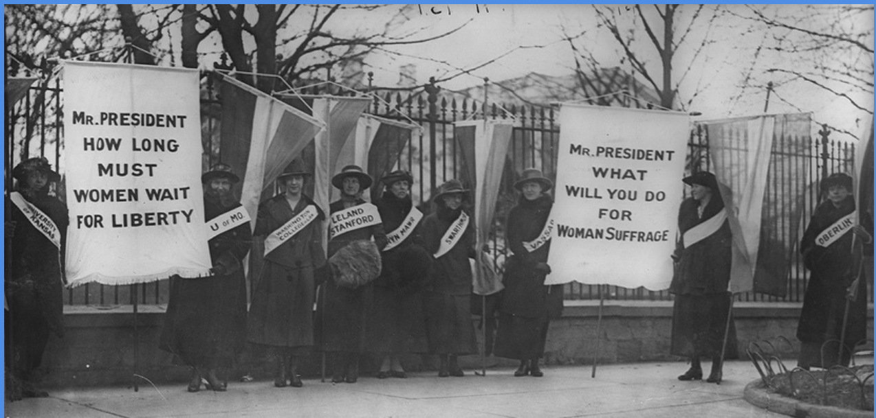
Silent Sentinels Picketing the White House, 1917