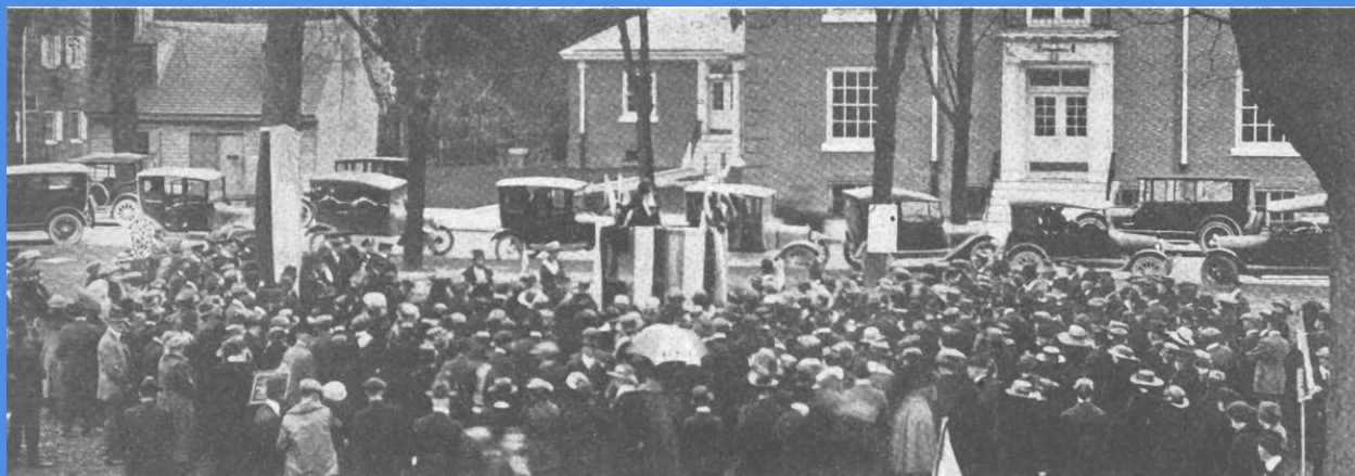
Suffrage Rally, Dover, DE, May 1920

Join us in celebration of our opening a new exhibition "The Big Shebang: Who and What They Fought For". This exhibition commemorates the work of Middletonians and Delawareans in the fight for the vote through art created by students at Appoquinimink High School and in partnership with the Gibby. A socially distanced opening will be held at the Historical Society and The Gibby on Saturday, November 14th, details to follow.