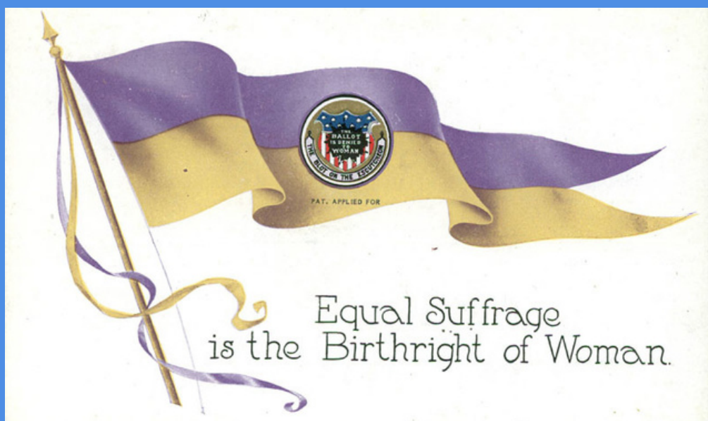
Photo credit: postcard, 1910, National American Woman Suffrage Association

The Society does not currently have a photograph of Wedler.